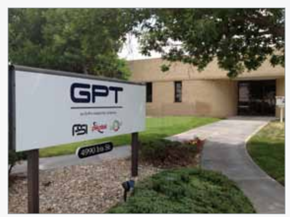
GPT Wheat Ridge, Colarado

At GPT we are committed to manufacturing and supplying only reliable, high-quality products that exceed our customers' requirements and expectations.